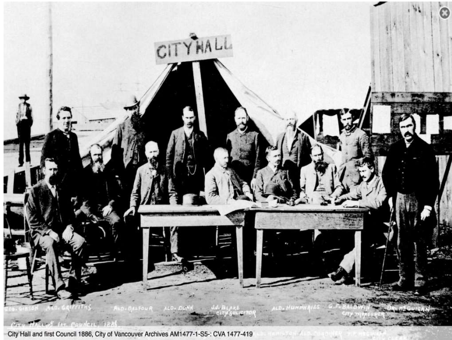
Figure 1: Vancouver City Council, 1886

living in Stanley Park was well known to authorities throughout this time, as seen in the map at Figure 2. 17