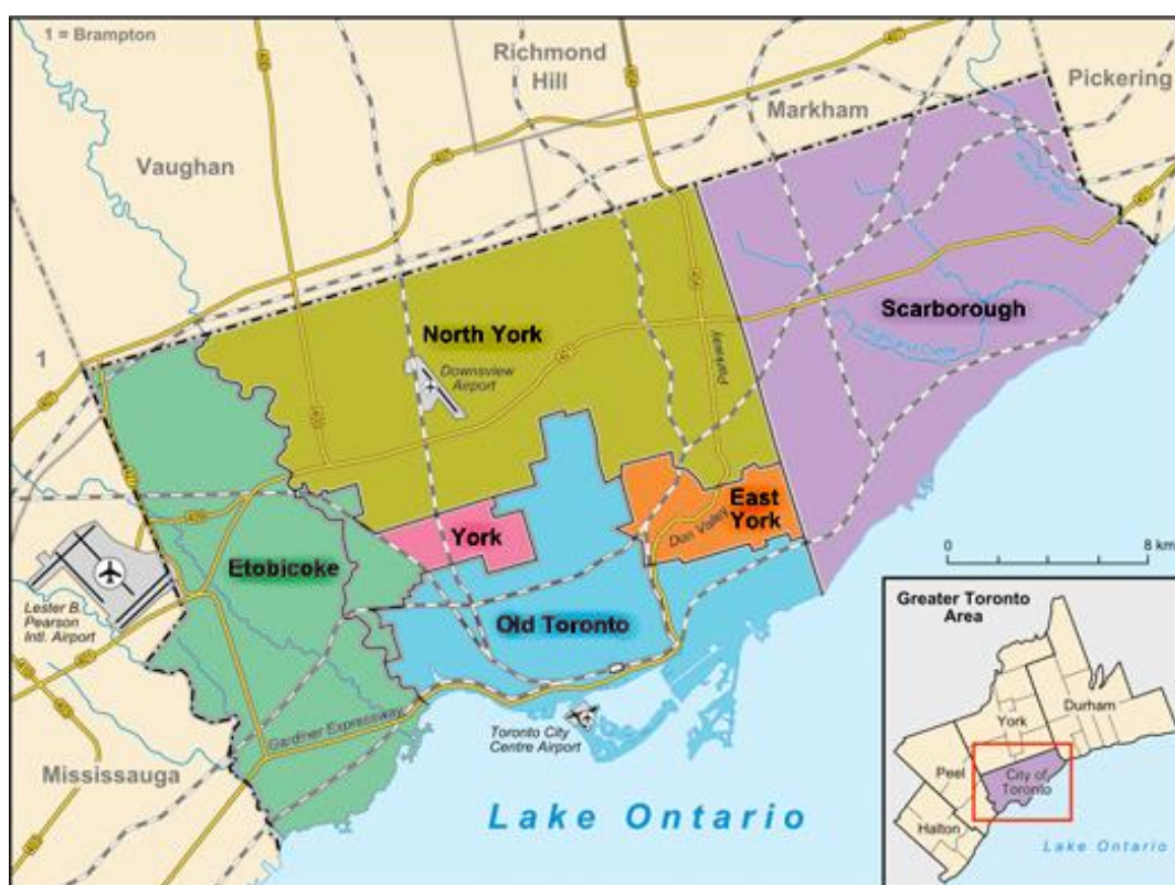
Figure 1: City of Toronto: Map of the pre-amalgamated municipalities, 1967-1997 40